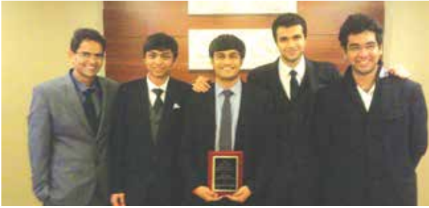
National Winners of Jessup Moot 2017

of the 34th BCI Moot Court Competition, 2017. They have won a host of citations including Best Memorial for finals. Participants were adjudged as best Female Advocate as well as best Speaker for Final Rounds & as best Male Advocate and Best Speaker for Third Round.