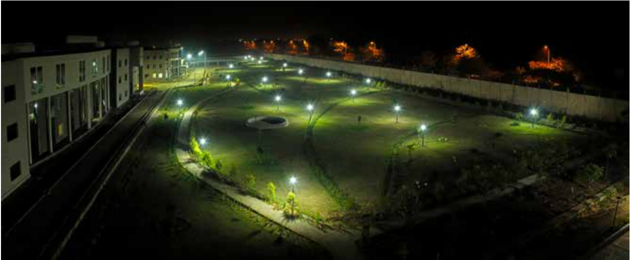
Night view @ NLUO

We have emerged as centre of excellence through the following well defined course of actions: