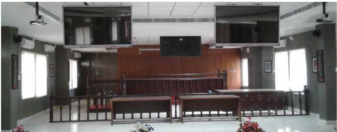
Moot Court Hall