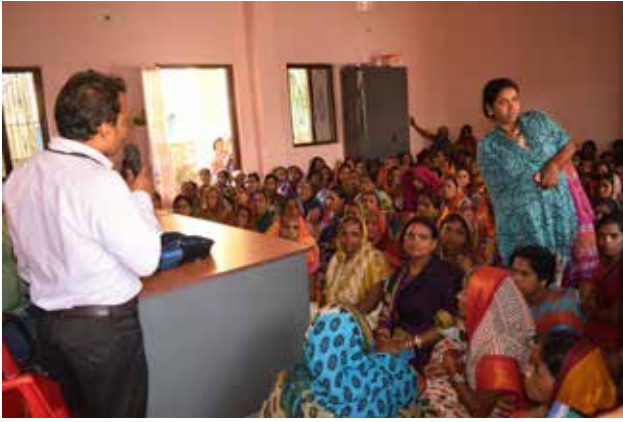
Legal Aid Clinic under Access to Justice (UNDP Project)