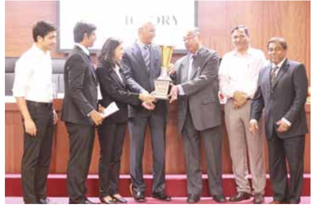
Maritime Arbitration Moot Court Competition

Project in Higher Education in the State of Odisha would examine the reasons for pendency of cases and find out the common legal issues.