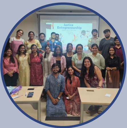
Centre for Public Policy, Law and Good Governance