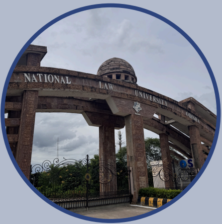
National Law University, Odisha