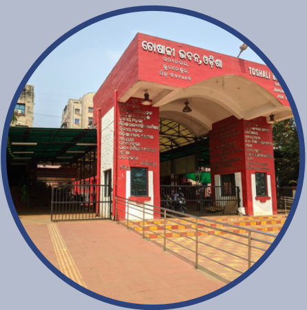
Odisha Human Rights Commission