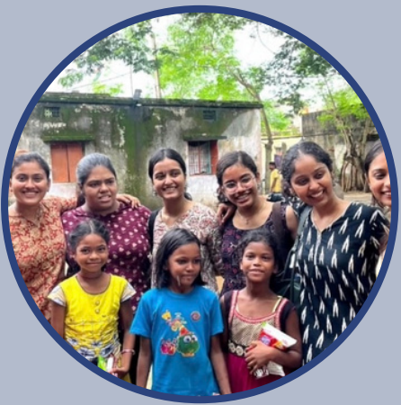
Legal Services Committiee