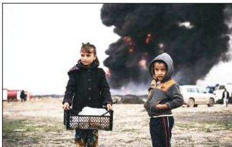
Figure 5: https://www.unicef.org/press-releases/staggering-scale-grave-violations-against-children-conflict-revealed-new-unicef