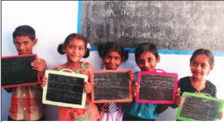
Figure 3 https://www.theindiaforum.in/article/building-foundations-well-challenge-primary-education