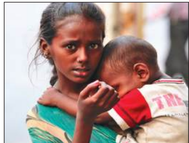
Figure 2: https://4.bp.blogspot.com/-trOh9TCO3mE/VaP6W-gtDII/AAAAAAAAAFI/WS2CMj9hKY4/s1600/kristian-bertel-220.png

Thought : It is a tragic reality that children are often compelled to work in hazardous employments such as mines.