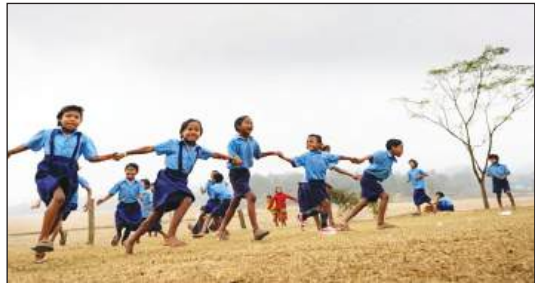
Figure 4 https://www.indianyouth.net/indians-discourage-children-playing-sports/

Thought : The children look underprivileged, but they are happy and satisfied. It looks like they are playing and enjoying themselves during the break hours of their school. It could also be possible that they bunked school despite the government and their guardians ensuring they have the benefit of going to school.