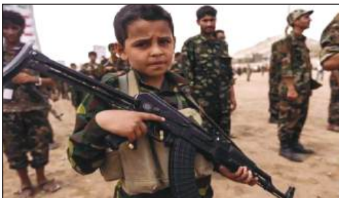
Figure 3: https://www.google.com/imgres?imgurl=https%3A%2F%2Fimg.dunyanews.tv%2Fnews

Thought : Children who should be in school and should be having a healthy and happy childhood, are forced to take up arms to protect themselves and their families. Safeguards should be put in place to prevent children from being dragged into wars waged due to political and other reasons.