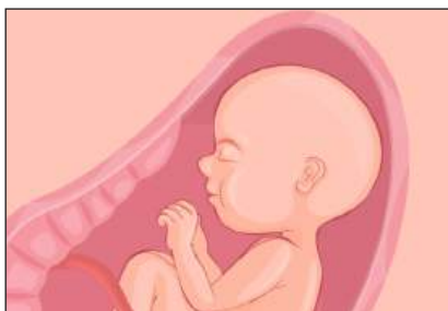
Figure 1: https://www.ck12.org/book/ck-12-biology-advanced-concepts/section/17.85/