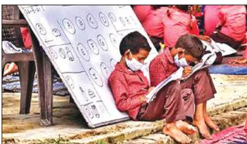
Figure 5: https://www.google.com/imgres?imgurl=https%3A%2F%2Fstatic.toiimg.com

Thought: Right to education is protected by the Indian Constitution. The children in the picture can be seen exercising this right and receiving the education they deserve for a bright future.