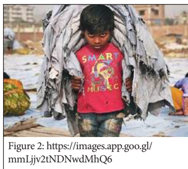
Figure 2: https://images.app.goo.gl/mmljjv2tNDNwdMhQ6

Thought : This picture depicts that these children who should ideally be in school receiving education, are made to work just to earn bread for their family.