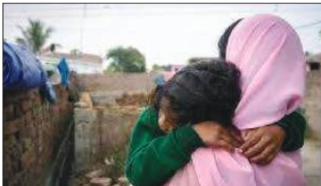
Figure 5: https://www.slic.org.in/training/east-medinipore-district-meeting-6152e3b8dcfe7