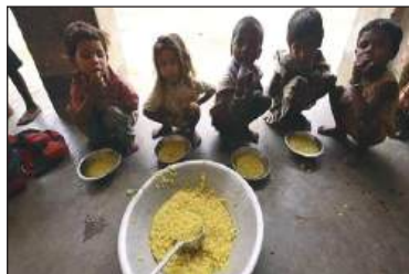
Figure 2: https://indianexpress.com/article/india/mid-day-meal-scheme-is-now-pm-poshan-pre-primary-children-will-be-covered-7542748/

Thought : It's hard not to notice how frail and distressed they appear. They look malnourished, desperate, and struggling in an unhealthy condition.