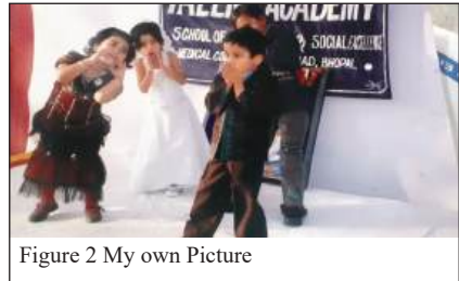
Figure 2 My own Picture

Thought : This is a photo from my childhood of me performing at my school's annual day. It takes me back to when my self-expression was more spontaneous and uninhibited.