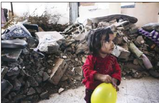
Figure 4: https://unicrio.org.br/2014-um-ano-devastador-para-as-criancas-do-mundo-diz-unicef/

Thought : From the picture, it can be inferred that the child could have been separated from the parents in a war-stricken region. Such a situation can lead to a humanitarian crisis where there is a shortage of necessities like food, clean water and medical aid due to the ravages of war, including heavy shelling and destruction.