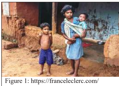
Figure 1: https://franceleclerc.com/