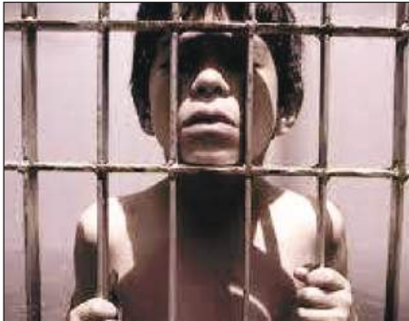
Figure 1: https://www.hindustantimes.com/india-news/india-has-over-5-600-techies-in-prisons-27-37-inmates-illiterate-govt-data-101613301444242.html