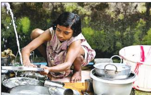
Figure 4: https://im.rediff.com/money/2017/jul/27child-labourer-in-india.jpg?w=670&h=900

Thought : Due to financial constraints in many households in India, the children of such households are deprived of their Right to Education because they are forced to work in shops or other households to earn for their family's survival.