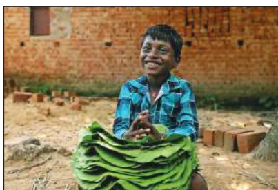
Figure 3 https://www.smilefoundationindia.org/blog/pandemic-inverts-movement-against-child-labour/