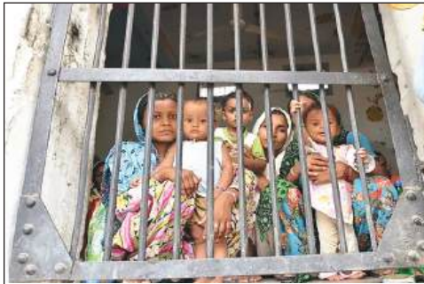
Figure 5 https://criminallawstudiesnluj.wordpress.com/2020/07/14/open-jails-for-women-the-disguised-discrimination/