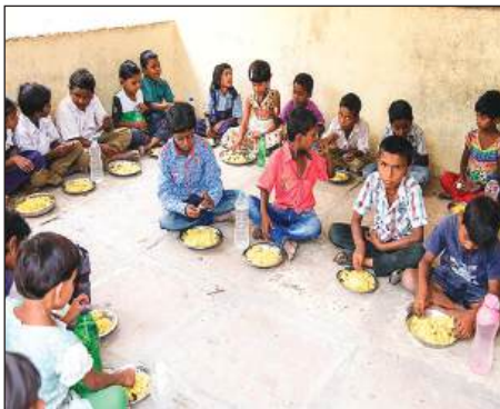
Figure 5: https://www.forbesindia.com/blog/health/mid-day-meal-scheme-a-nutritious-promise-to-boost-learning-outcomes/