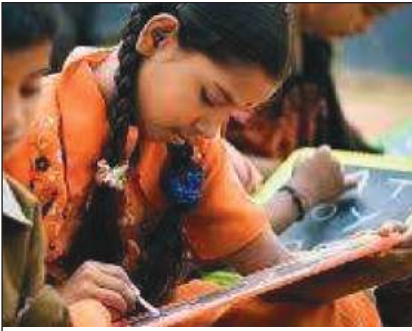
Figure 3: https://www.telegraph.co.uk/news/worldnews/asia/india/12020734/Schoolchildren-in-India-made-to-wear-colour-coded-wristbands-to-show-caste.html