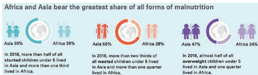
Figure 6 https://www.semanticscholar.org/paper/Childhood-Malnutrition-in-India-Singh/23ed5aa070df382c2b0aeeac724a5df6f09815a2