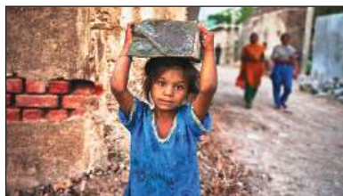
Figure 2: https://www.voicesofyouth.org/blog/lost-childhood-child-labor

Thought : The primary cause behind children engaging in labor is often the economic hardship experienced by their families, leaving them with little choice. The child should not be carrying such heavy things on her head but she has no choice as she needs to do this for her survival.