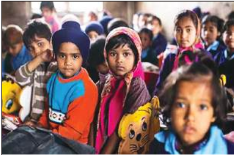
Figure 5: https://www.theguardian.com/education/2013/mar/11/indian-children-education-opportunities