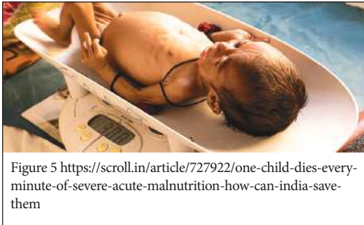
Figure 5 https://scroll.in/article/727922/one-child-dies-every-minute-of-severe-acute-malnutrition-how-can-india-save-them