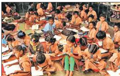
Figure 1: https://m.economictimes.com/news/politics-and-nation/why-is-making-children-turn-away-from-government-schools/articleshow/62942100.cms