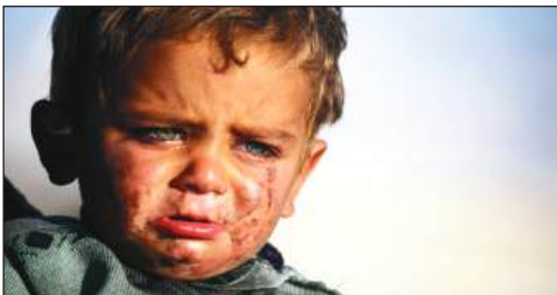
Figure 5 https://www.france24.com/en/20170330-number-syrian-refugees-passes-5-million