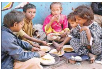
Figure 1: https://images.app.goo.gl/gRRVuYJcuSzu5ctd7