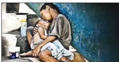
Figure 3: https://www.google.com/imgres?imgurl=https%3A%2F%2Fi.pinimg.com