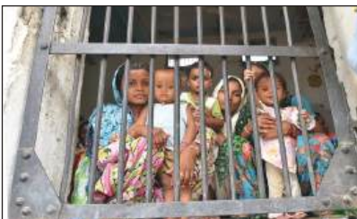
Figure 3 https://images.app.goo.gl/5tKjNM8pgNVPBB6R6