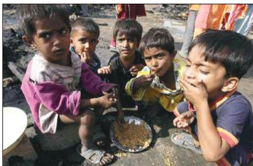
Figure 5 https://irannewswire.org/widespread-iran-poverty-will-lead-to-regimes-downfall/?amp