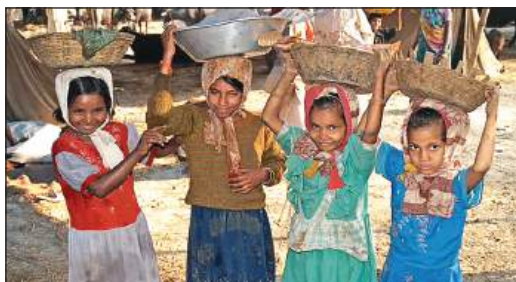
Figure 5: https://www.unicef.org/press-releases/massive-data-gaps-leave-refugee-migrant-and-displaced-children-danger-and-without