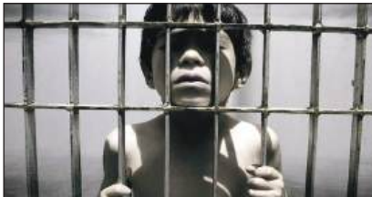
Figure 1: https://ahvalnews.com/childrens-rights/624-young-children-behind-bars-turkey