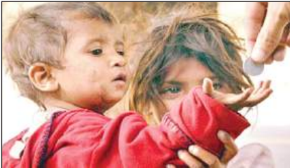
Figure 1 https://assets.thehansindia.com/h-upload/2022/07/07/1301757-begging.webp