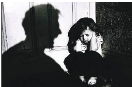
Figure 4: https://www.indiatoday.in/education-today/news/story/mms-scandal-sex-sexual-molestation-harassment-child-abuse-116628-2012-09-20

Thought : It depicts child abuse. It looks like the parent is screaming at the child for something she might or might not have done. The child is sitting in a stressful and protective pose. Every child should have a nurturing and stress-free household for proper growth of child physically and mentally.