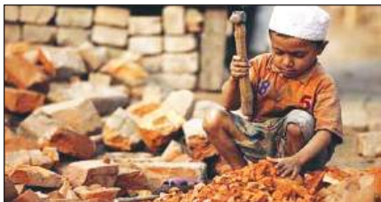
Figure 3: https://www.indiatodayne.in/assam/story/five-minor-children-rescued-bonded-labour-assam-399254-2019-06-17