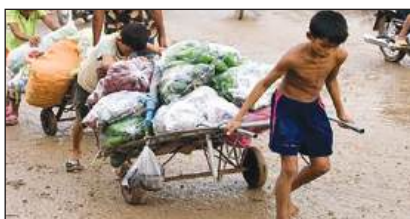
Figure 3: https://www.ck12.org/book/ck-12-biology-advanced-concepts/section/17.85/