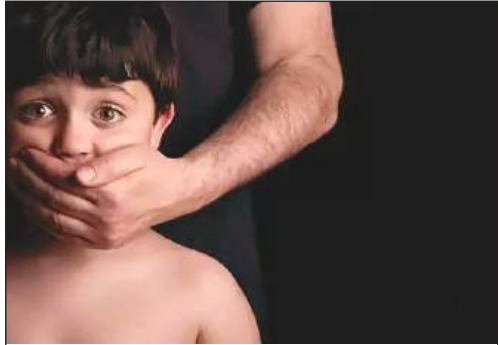
Figure 4 https://m.timesofindia.com/india/377-websites-hosting-child-porn-material-taken-down/articleshow/72274294.cms

Thought : This image evokes a series of different emotions. I feel guilty and disgusted by the present state of affairs wherein we have failed miserably in our duty towards protecting children around the world.