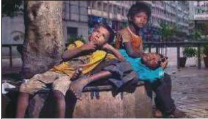
Figure 1 https://www.google.com/imgres?imgurl=https%3A%2F%2Fflawtrend.in