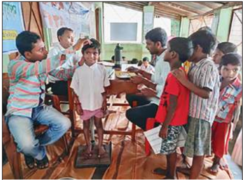
Figure 4: https://chlss.org/blog/lot-love-give/

Thought : The children are getting a medical check-up which shall provide them with a better understanding of their body. It will also be helpful as it could identify any ailments which need to be treated immediately. There is a sense of comfort in knowing that these children, who appear to be of an underprivileged background are cared for and looked after.