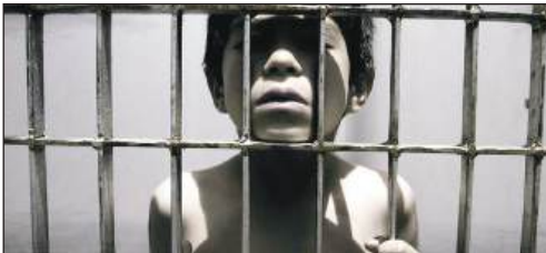
Figure 5: https://www.patrika.com/bhopal-news/child-rehabilitation-children-are-struggling-with-serious-mental-disor-3548307/