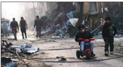
Figure 2 https://www.businessinsider.in/this-is-syrias-third-largest-city/articleshow/35034370.cms