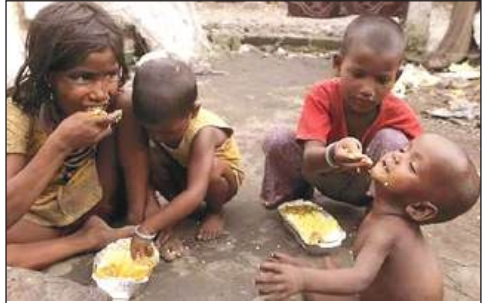
Figure 4 https://images.squarespace-cdn.com/content/v1/593ef400d2b85780fbc82544/7cd65975-2481-41f7-8c8e-08c9be7f62f0/poverty-june.jpg?format=1500w

Thought : The plight of these children, burdened with the responsibility of caring for younger siblings despite their own youth, evokes a profound sense of despair in me. They have to live in unsanitary surroundings, and beg for food, or collect it from disposed dumps.