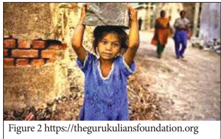
Figure 2 https://thegurukuliansfoundation.org

Thought : At an age, when they should be playing with their friends and not worrying about anything, they are carrying the burden and responsibility of their family with some children even being the sole bread-earner.