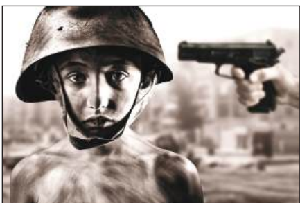
Figure 3: https://www.futurelearn.com/info/courses/human-rights-and-international-criminal-law/0/steps/68741

Thought : This picture rendered me speechless. The loss of innocence in his eyes. The harsh extremities of war. An innocent child is a victim of war crimes for no fault of his own.