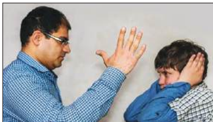
Figure 1 https://www.parentcircle.com/effects-of-beating-hitting-slapping-a-child/article