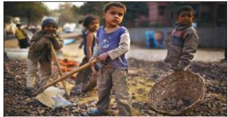
Figure 4: https://www.theguardian.com/sustainable-business/2015/jan/13/businesses-eradicate-child-labour-live-chat

Thought : Every child deserves to enjoy their childhood to the fullest, but here these children are doing intense labour which will affect them physically, mentally, and emotionally.