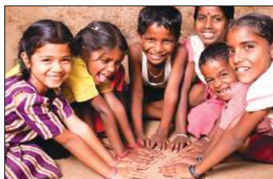
Figure 2: https://www.siegwerk.com/en/sustainability/people-and-community/corporate-social-responsibility/lighthouse-projects/detail/projects/india-siegwerk-continues-multi-project-approach-with-2021-lighthouse-project.html

Thought : Seeing the picture of village children playing together and having fun at home brings a smile to my face and fills me with joy. It is heartwarming to see children enjoying their childhood and each other's company.