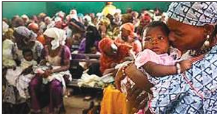
Figure 5 https://images.app.goo.gl/9dcbWzhnzYZzoSP7A