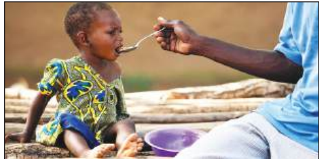
Figure 4 https://www.unicef-irc.org/article/1626-first-global-estimates-of-food-insecurity-among-households-with-children.html

Thought : Food insecurity can have severe physical and mental health consequences, especially for children. Malnutrition, stunted growth, and increased susceptibility to diseases are few examples of the health impacts of food insecurity. It can also affect cognitive development, leading to poor academic performance and limited opportunities for the future.