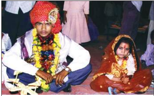
Figure 4 https://www.independent.co.uk/asia/india/rajasthan-child-marriage-bill-gehlot-b1923327.html

Thought : The image portrays the tragedy of child marriage, illustrating a young girl's loss of hope, childhood, education, autonomy, and freedom. Subjected to physical and psychological trauma, she faces severe consequences, underscoring the dire impact of this harmful practice.