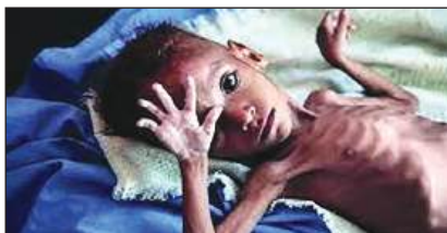
Figure 3: https://www.asianage.com/india/all-india/250919/malnutrition-free-india-by-2022-is-it-a-realisable-goal.html