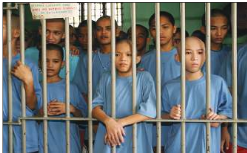
Figure 5 https://www.ucanews.com/news/street-children-need-shelter-not-a-jail-cell/78566