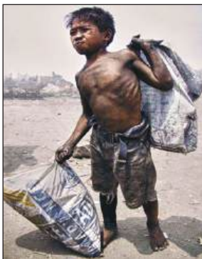
Figure 1 https://www.linkedin.com/pulse/education-india-burden-anindyaa-ghosh/?utm_source=share&utm_medium=member_android&utm_campaign=share_via