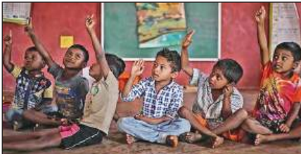
Figure 1 https://twitter.com/DResistance2day/status/1455969365614944258