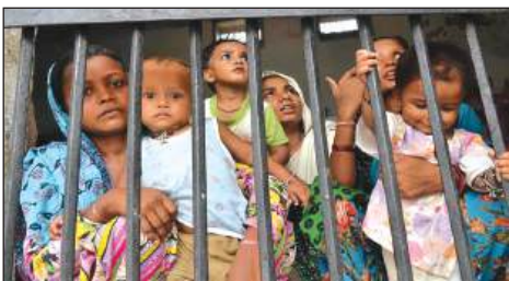
Figure 5: https://www.lowyinstitute.org/the-interpreter/india-guiltless-children-prison