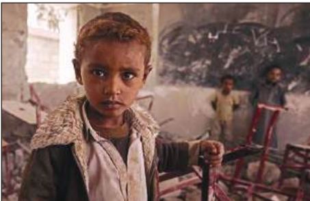
Figure 5 https://www.un.org/en/global-issues/international-law-and-justice