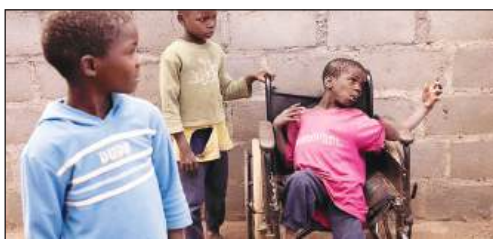
Figure 5: https://www.borgenmagazine.com/