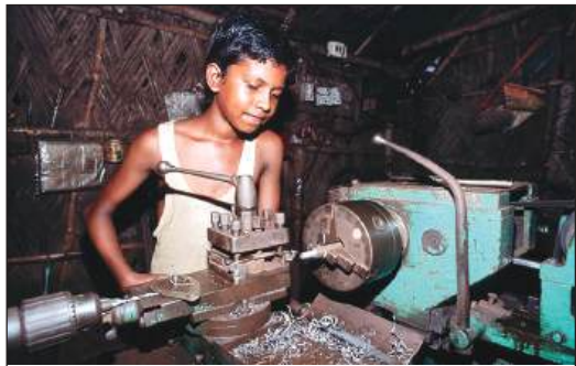
Figure 2: https://www.google.com/imgres?imgurl=https%3A%2F%2Fc8.alamy.com%2Fcomp%2FC8XKRG%2Fchildren-work

Thought : The child in this picture is young and is entitled to education. Instead he has to work to sustain the financial needs of the family.