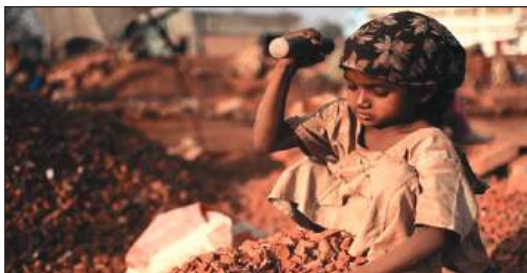
Figure 4: https://www.gandhiforchildren.org/world-child-labor/

Thought : The picture depicts Child labour. At the age of playing with toys, she is working to earn money.