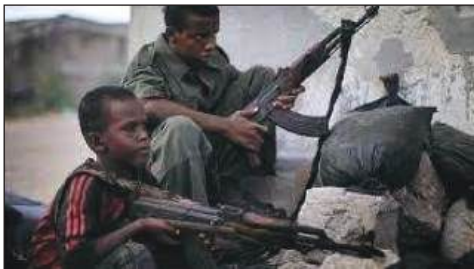
Figure 5 https://www.google.com/imgres?imgurl=https%3A%2F%2Fstatic01.nyt.com