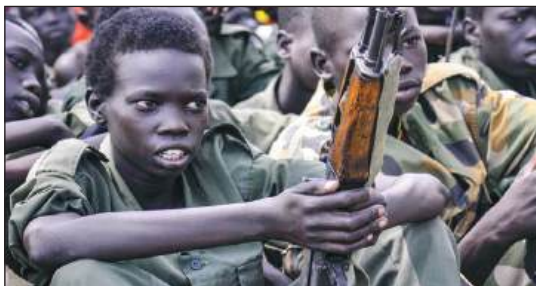
Figure 4 https://www.google.com/url?sa=i&url=https%3A%2F%2Fwww.nytimes.com%2Finteractive%2F2016%2Fworld%2Fak-47-mass-shootings.html&psig=AOvVaw3X5PgxBzn24212djOhRmWP&ust=1706793564234000&source=images&ccd=vfe&opi=89978449&ved=0CBEQjRxqFwoTCLji--Hbh4QDFQAAAAAdAAAAA

Thought : This picture shows certain children holding guns in their hands. Their faces look cold and agitated. The first thought that occurs to me is that in the age of holding crayons and colours of happiness in their hands, they hold guns and are splashed with the colour of blood amidst life and death.