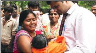
Figure 1: https://www.bbc.com/news/world-asia-india-41154846