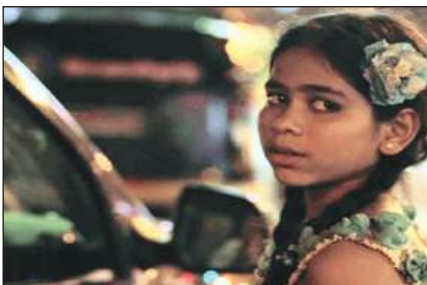
Figure 3: https://www.firstpost.com/living/viral-video-on-child-prostitution-in-india-says-dont-look-away-1248735.html