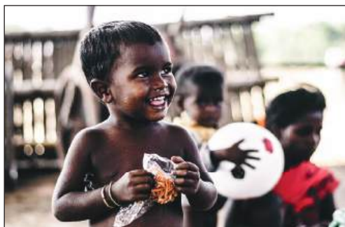
Figure 4: https://www.google.com/imgres?imgurl=https%3A%2F%2Fimages.unsplash.com