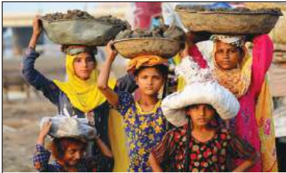
Figure 1 https://www.humanium.org/en/child-labour/