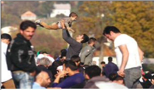
Figure 1: https://www.google.com/imgres?imgurl=https%3A%2F%2Fwww.japantimes.co