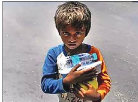
Figure 4: https://m.economictimes.com/news/india/over-30000-children-orphaned-lost-a-parent-or-abandoned-due-to-covid-19-ncpr-tells-sc/articleshow/83308281.cms

Thought : Seeing a child who may be abandoned receiving a food packet and water bottle brings to mind the harsh reality that for many children around the world, necessities like food and water are not a given. It is heartbreaking to see a child in need.