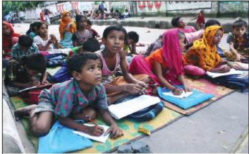
Figure 4: https://www.google.com/imgres?imgurl=https%3A%2F%2Fc8.alamy.com%2Fcomp

Thought : The picture depicts that kids, despite their daily struggles in life, are still trying to learn and get educated.