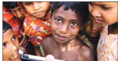
Figure 2 https://borgenproject.org/how-access-to-financial-services-fights-poverty/

Thought : Financial instability profoundly impacts children, hindering access to basic needs, education, and healthcare, thereby impeding physical, emotional, and social development. The resulting stress and uncertainty may contribute to long-term mental health consequences.