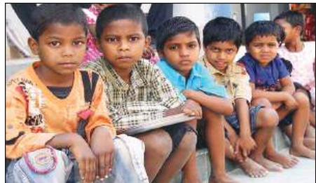
Figure 2 https://www.google.com/imgres?imgurl=x-raw-image%3A%2F%2F9d8c9f99ddad1cb920f1fa8f30cd05e03a77e5273f4adcc6e49a1381e84185c&tbid=y9HanZ-fj0DTM&vet=12ahUKewim5pezzaDAX7rmMGHFQ1CGEQMygAegQIARBL..i&imgrefurl=https%3A%2F%2Fnhrc.nic.in%2Fsites%2Fdefault

Thought : The children in this picture seem distant and at an age when they should be enjoying a carefree existence with family, orphaned children have to deal with the loss of parents, or abandonment, while fighting for the limited resources available in India's overcrowded orphanages.