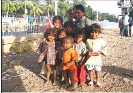
Figure 4: https://www.globalgiving.org/projects/empowerment-of-300-street-children-in-vellore

Thought : This picture might be an intersection of child trafficking, migrant children and child sex workers. This picture portrays childhood being taken away from this picture.