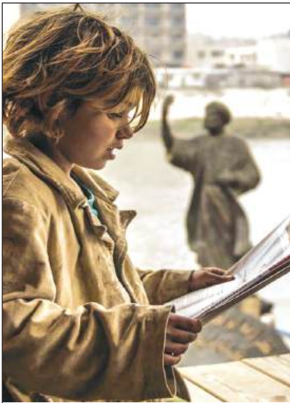
Figure 5 https://indianexpress.com/article/cities/mumbai/state-not-doing-enough-to-prevent-child-marriage-cag/&gt;