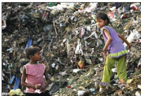
Figure 5: https://www.chinadaily.com.cn/photo/att/site1/20060609/xin_07060309062428846983.jpg