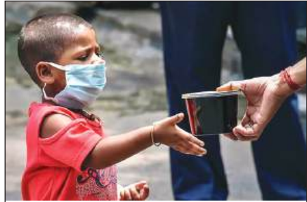
Figure 4: https://www.news18.com/news/buzz/telangana-government-employee-is-helping-lost-people-reunite-with-their-families-3952661.html

Thought : A helpless child with a mask on, on the receiving end of a man’s kindness. The child is surviving, not living. It is relieving to think that the child went to bed with a full stomach.