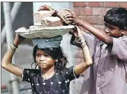
Figure 5: https://timesofindia.indiatimes.com/city/indore/madhya-pradesh-4-kids-among-18-rescued-from-bonded-labour/articleshow/88466528.cms