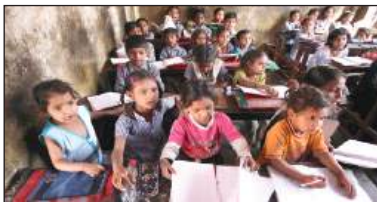
Figure 3: https://cochins.org/wpcontent/uploads/2022/07/16a.png

Thought : Children are forced to beg on streets due to poverty, abandonment or after being trafficked.