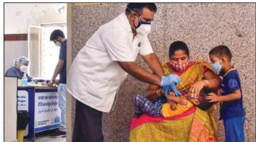
Figure 2 https://indianexpress.com/article/cities/hyderabad/telangana-child-care-centre-covid-patients-7304015/

THOUGHT : Little children forced to stay indoors, and required to wear masks when they step out are sights that always make me anxious and worried; just like the mother and brother of the kid getting swabbed in the image. The pandemic has put a massive strain on the health of children.