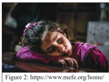
Figure 2: https://www.mefe.org/home/

Thought : The child depicted in the picture appears to be sad, and possibly yearning for a different life. The child is likely in a refugee camp, having fled from a war-ravaged area.