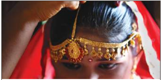
Figure 4: https://www.unfpa.org/child-marriage

Thought : She is only a child being married off at a very tender age, while children of that age are supposed to develop their social skills and enhance the same.