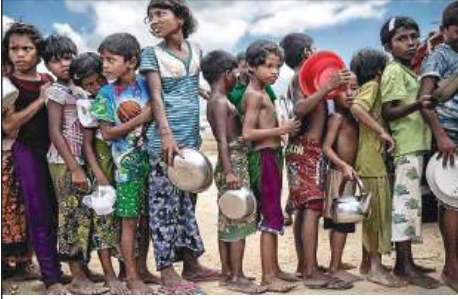
Figure 3: https://www.bbc.com/news/in-pictures-52453683