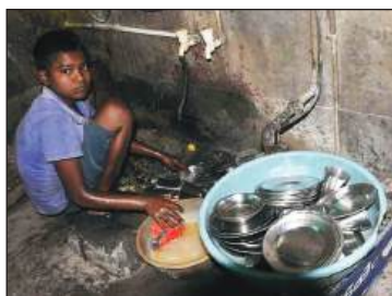
Figure 3: https://www.unicef.org/press-releases/massive-data-gaps-leave-refugee-migrant-and-displaced-children-danger-and-without