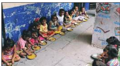
Figure 1: https://www.brecorder.com/news/40285670/kse-100-down-081-as-profit-taking-rumours-dominate-session