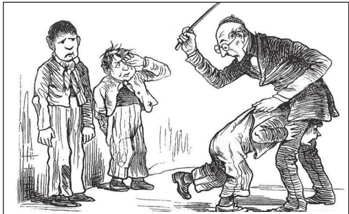
Figure 4 https://medium.com/@azrakhn9913/corporal-punishment-in-schools-madrassas-8a67cea32f75

Thought : The child goes through corporal punishments it imbibes psychological trauma along with layers of fear.