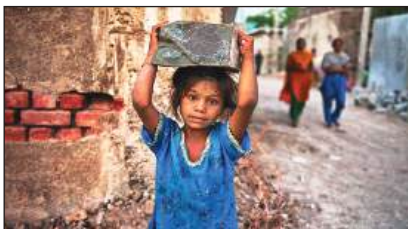
Figure 3: https://satyarathi.org.in/child-labourers-return-home/