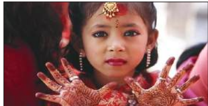
Figure 2: https://www.indiatoday.in/education-today/gk-current-affairs/story/child-marriage-india-1293581-2018-07-23

Thought : At the age when children should play house game with dolls, this child is getting married and will now have to handle a household and a family.