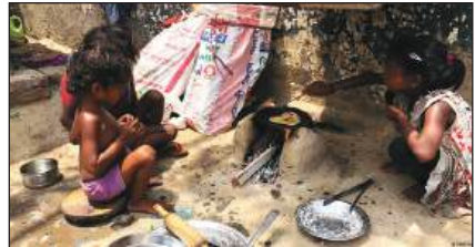
Figure 2: https://www.nationalheraldindia.com/opinion/freedom-from-hunger-is-ultimate-fundamental-right-any-nation-unable-to-ensure-this-is-a-failed-state

Thought : A young girl child is cooking food for her younger siblings, instead of playing games in which she is expected to play games, and watch cartoons.