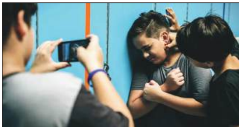
Figure 4: https://www.shutterstock.com/

Thought : The child is getting bullied by his batch mates. Some people find this okay but some people find it entirely traumatic and suffer through various anxiety issues and mental stress throughout their life. Sometime these bullying can become in form of harassment which can also lead the victim to commit suicide.