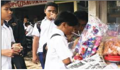
Figure 3: https://medium.com/@ASH_LDN/tobacco-industry-marketing-aimed-at-children-5879a5927176