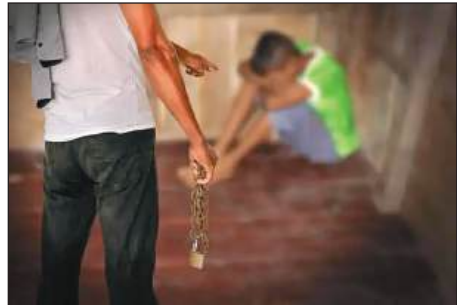
Figure 4 https://www.livemint.com/Politics/Bv4TbeToCpVS9j4IX3hJjN/The-rising-trend-of-child-abductions-in-India.html

THOUGHT : Children who have experienced kidnapping often suffer from persistent fear and anxiety. The trauma of being forcibly taken away from familiar surroundings and loved ones can lead to long-lasting emotional distress. I feel an overwhelming sense of helplessness when I look at the child in the picture who is confined against his will.