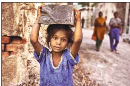
Figure 1: https://www.unicef.org/eu/stories/high-level-dialogue-action-child-labour