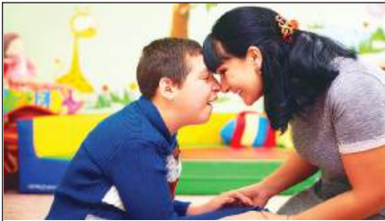
Figure 1 https://raisingchildren.net.au/autism/behaviour/understanding-behaviour/challenging-behaviour-asd