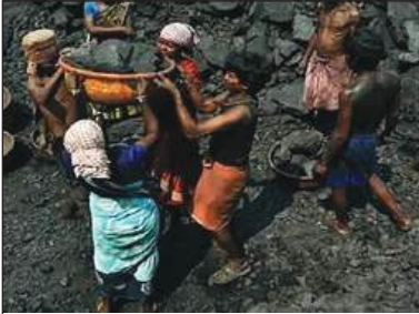
Figure 1: https://images.news18.com/ibnlive/uploads/2016/03/coal-mines.jpg?impolicy=website&width=510&height=356