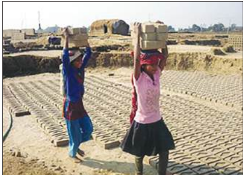
Figure 4: https://www.businesstoday.in/latest/economy-politics/story/modern-day-slavery-human-trafficking-child-labour-bondage-workers-child-marriage-india-slavery-anti-slavery-law-uk-govt

Thought : It gets me worried about the future of both the children. Instead of getting proper education, they are working hard to earn some money to satisfy their hunger. There might be more members of their family back at home for whose sustenance they are working.