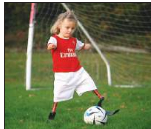
Figure 2 https://dailymail.co.uk/health/article-2063565/Meningitis-victim-defies-odds-play-school-football-team.htm

Thought : The image of a girl playing football is a source of inspiration, showcasing the strength of resolute