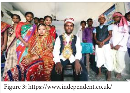
Figure 3: https://www.independent.co.uk/