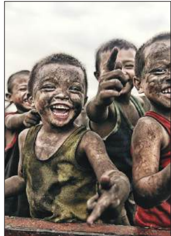
Figure 2: https://medium.com/@parah/the-source-of-true-happiness-19f1f51a1163

Thought : These children are living in a war-like situation. They are not aware of whether they will be able to see the next morning or not. But despite the hardships, the smile on their face is pure and genuine; enough to motivate a person.