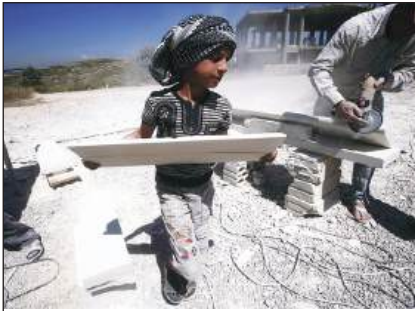
Figure 1: https://www.dailyexcelsior.com/