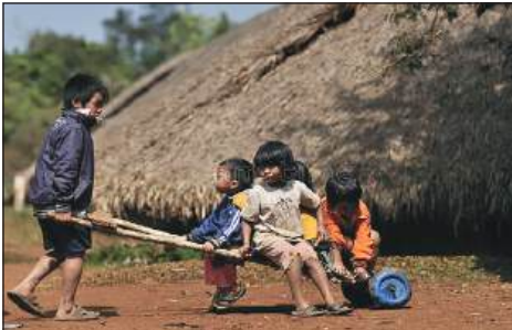
Figure 1: https://www.bbc.com/news/in-pictures-52453683