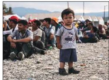
Figure 2: https://www.biomedcentral.com/collections/minorityandmigranthealth

Thought : The picture is set in the background of a refugee camp. The life of a migrant or refugee child, especially if displaced at a young age, is filled with hardships and uncertainty. Moreover, a sense of homelessness is also instilled in most refugee children, whose futures appear to be unclear due to the perils of circumstances.