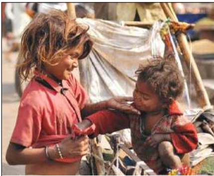
Figure 5: https://milaap.org/fundraisers/priyankasaxena94