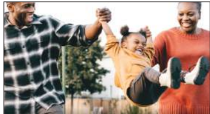
Figure 2 https://everyfamilyforward.org/stories/story-bank

Thought : Observing a contented family with happy kids remind me of the value of affection, encouragement, and quality time spent together, in fostering an atmosphere where kids can grow and develop.