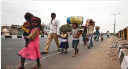
Figure 1: https://zeenews.india.com/india/no-data-available-on-migrant-deaths-due-to-covid-19-lockdown-government-tells-parliament-2309749.html