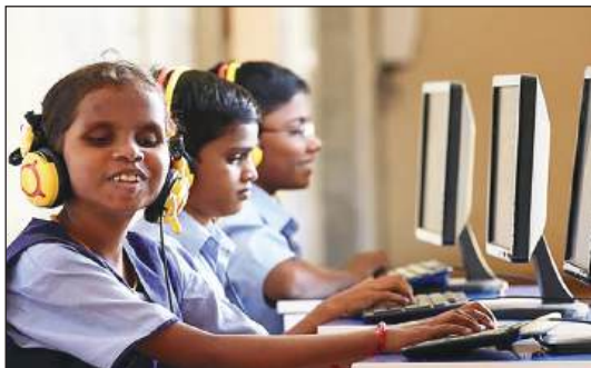
Figure 5: https://www.alamy.com/stock-photo-india-agra-child-in-school-uniform-using-smartphone-wearing-bluetooth-53235807.html