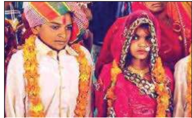
Figure 2 https://www.google.com/imgres?imgurl=https%3A%2F%2Fwww.jyotijudiciary.com

Thought : The thought that arises when looking at the picture is one of concern for the well-being of the children. It is alarming to think about the potential physical, emotional, and psychological harm that may result from children being forced into a marriage.