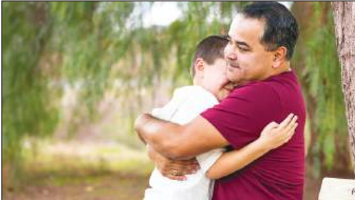
Figure 1 https://raisingchildren.net.au/school-age/health-daily-care/school-age-mental-health-concerns/mental-health-problems-in-children-3-8-years-signs-and-support