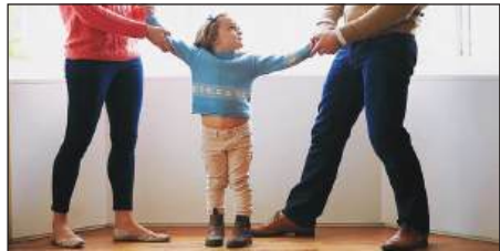
Figure 2: https://www.counsellingforkids.co.uk/services/family-counselling-children/#:~:text=There%20may%20be%20raised%20voices,consultation%2C%20with%20a%20qualified%20therapist

Thought : A Child is struggling between parents who wants to hold her hand. This depicts to me the question of custody of the children. And how do they deal with such state of separation of their parents.