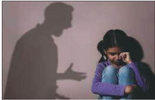
Figure 4 https://www.google.com/imgres?imgurl=https%3A%2F%2Fonline-learning-college.com

Thought : Who is responsible for the child’s abuse? How can we ensure that the child receives justice and support?