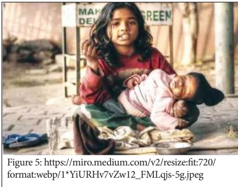
Figure 5: https://miro.medium.com/v2/resize:fit:720/format:webp/1*YiURHv7vZw12_FMLqjs-5g.jpeg