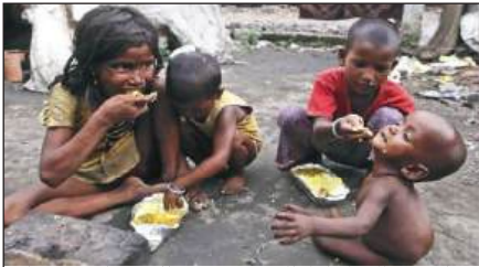
Figure 1: https://www.newsclick.in/India-Ranks-Poor-Wellbeing-Children-Among-Neighbours