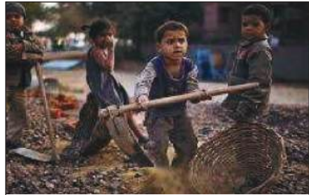
Figure 4: https://www.barandbench.com/news/litigation/child-trafficking-karnataka-high-court-personal-presence-bengaluru-city-police-commissioner

Thought : The four children in this picture are engaged in manual labour when they should be in school. Efforts should be made to enforce laws for child protection so that children can receive education and develop in a supportive environment.