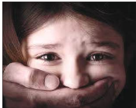
Figure 2: https://childsafety.losangelescriminallawyer.pro/family-abduction.html

Thought : The little girl in the picture is being forced to keep quiet. It seems like the child is a victim of sexual, physical and mental abuse. I get a feeling of helplessness after seeing this picture as there is an immense impact on the child's well-being after such events Sexual abuse is perhaps the worst violation of one's bodily autonomy.