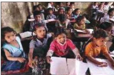
Figure 3 https://www.google.com/imgres?imgurl=https%3A%2F%2Fflawtrend.in