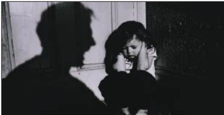
Figure 5 https://www.change.org/p/narendra-modi-abusive-parenting-has-to-stop-we-need-to-protect-our-children