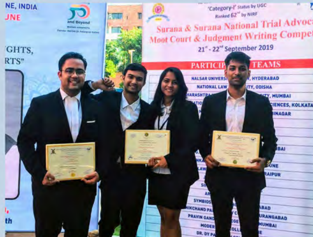
Surana & Surana National Trial Advocacy Moot Court & Judgment Writing Competition, 2019