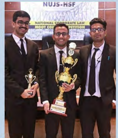
12th NUJS - HSF National Corporate Law Moot Court Competition, 2020