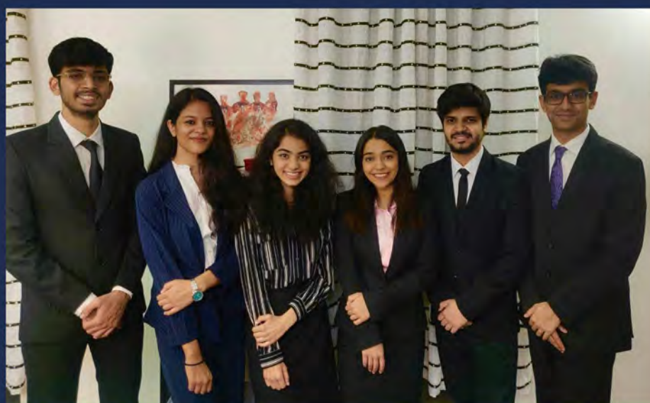
28th Willem C.Vis Moot Court Competition, 2021