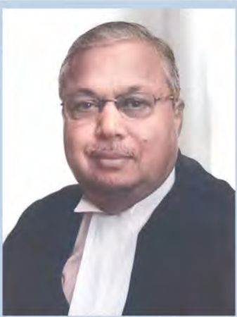
Hon'ble Mr. Justice VS Sirpurkar Former Judge Supreme Court of India

“NLUO is a relatively new college, but the students have been very active from the beginning and have been instrumental in growth of the university by leaps and bounds. I was captivated by the legal acumen and passion for the law that I witnessed in the interactions I had with NLUO students.