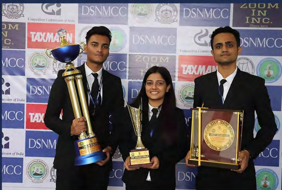
6th DSNLU CCI Moot Court Competition, 2020