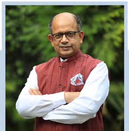
Dr. Amar Patnaik Member of Parliament Rajya Sabha

It gives me immense pleasure to see the overall growth of the University and its students over the years. I wish them luck and success for all their future endeavours.”