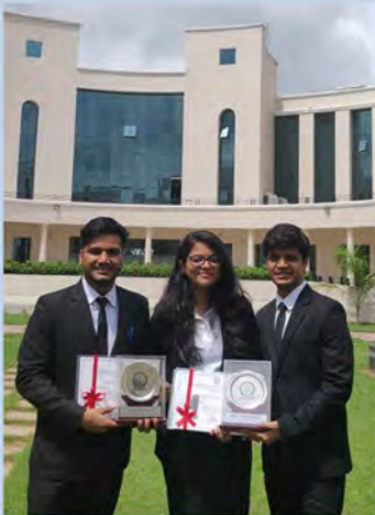
8th RGNUL Moot Court Competition, 2019