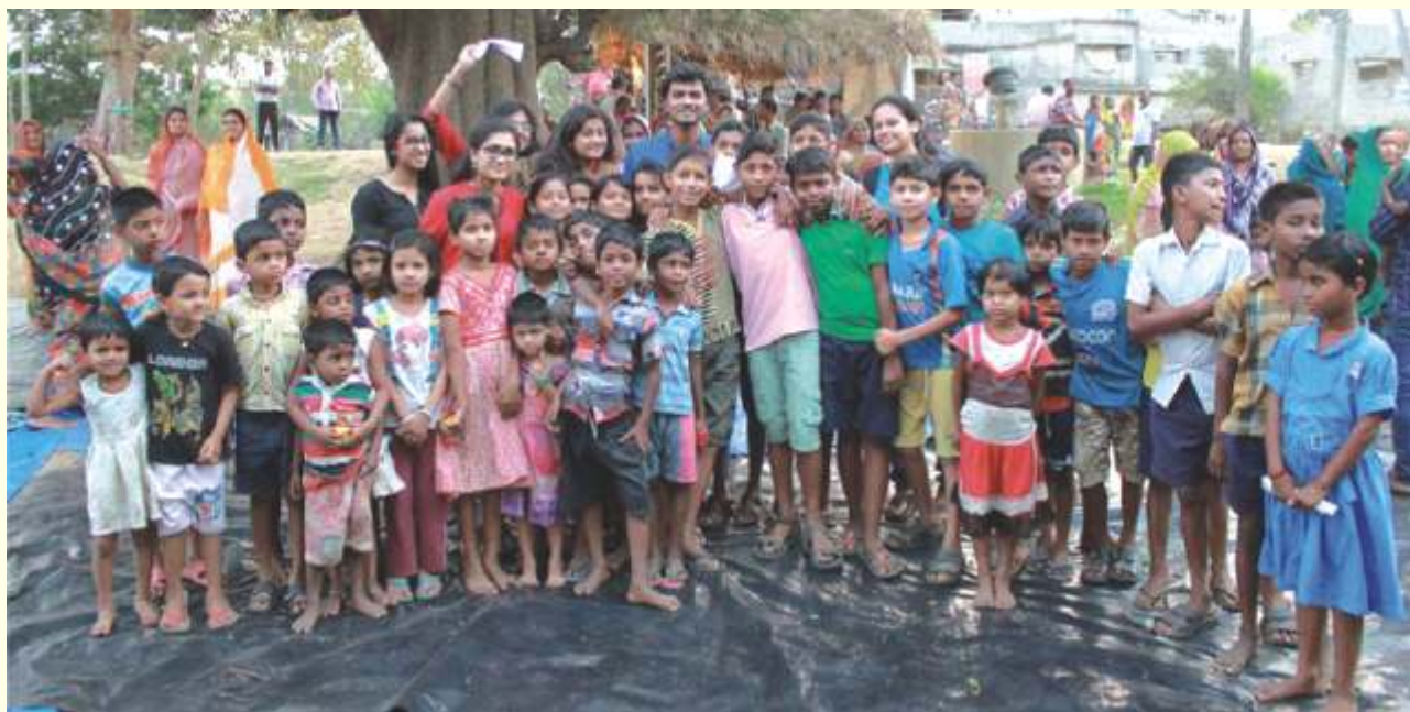
Students during Legalaid Clinic field work