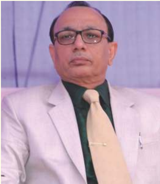
Chief Justice of Orissa High Court Chancellor, NLU Odisha