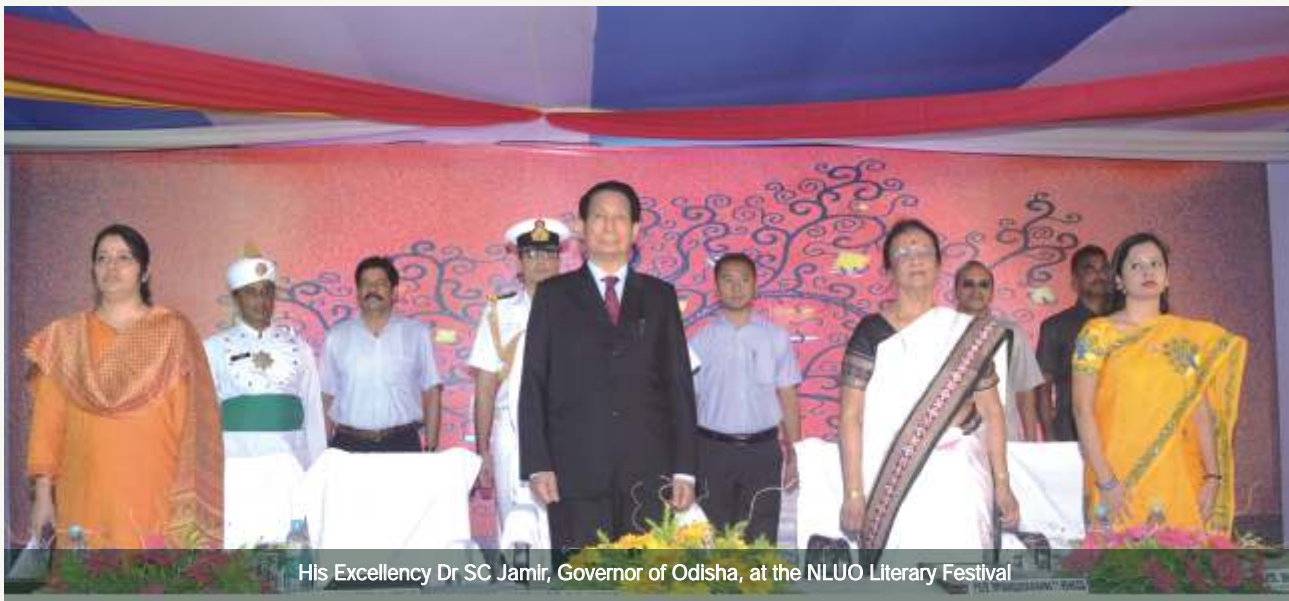
His Excellency Dr SC Jamir, Governor of Odisha, at the NLUO Literary Festival