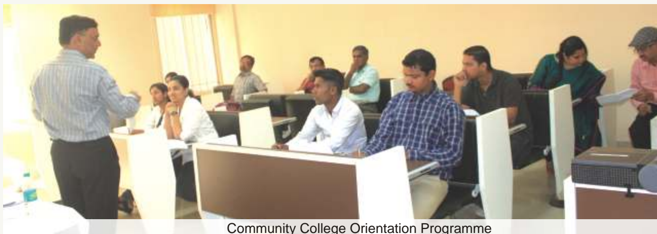
Community College Orientation Programme