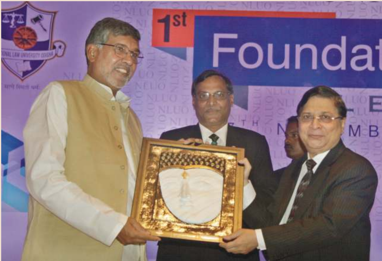
Hon'ble Justice Dipak Misra, Judge, Supreme Court of India & Visitor, NLUOdisha presenting the Memento to Sh. Kailash Satyarthi, Nobel Peace Prize Laureate and Founder, Bachpan Bachao Andolan on the eve of First Foundation Day of NLU Odisha