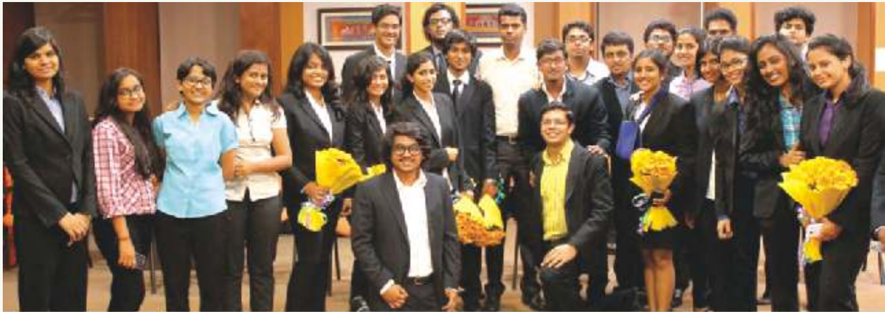
Student Volunteers of Child Rights Centre