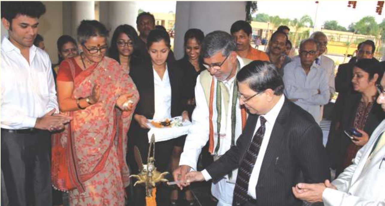
Hon'ble Justice Dipak Misra, Judge, Supreme Court of India & Visitor, NLU Odisha lighting the lamp along with Nobel Peace Prize Laureate and Founder, Bachpan Bachao Andolan Sh. Kailash Satyarthi on the occasion of inauguration of Administrative Block

NLUO was established keeping in mind a clearly enunciated vision. Right in the Preamble to the National Law University Act 2008 outlines, one may discern some long-term goals including: