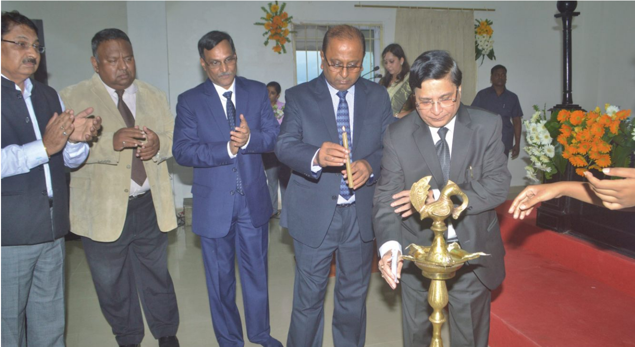
Hon'ble Mr. Justice Dipak Misra, Judge, Supreme Court of India & Visitor, NLUO lights the ceremonial lamp during Inaugural Ceremony of Sudhansubal Hostel on 6 September 2014

NLUO was established keeping in mind a clearly enunciated vision. Right in the Preamble to the National Law University Act 2008 outlines, one may discern some long-term goals including: