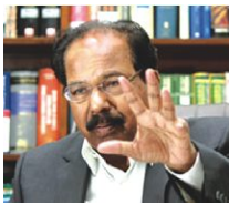
Hon'ble Mr. Verappa Moily, Former Law Minister of India