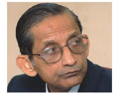
Hon'ble Mr. Justice S.B. Sinha Former Judge, Supreme Court of India