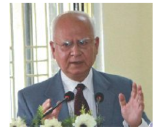
Hon'ble Mr. Justice Aftab Alam former Judge, Supreme Court of India