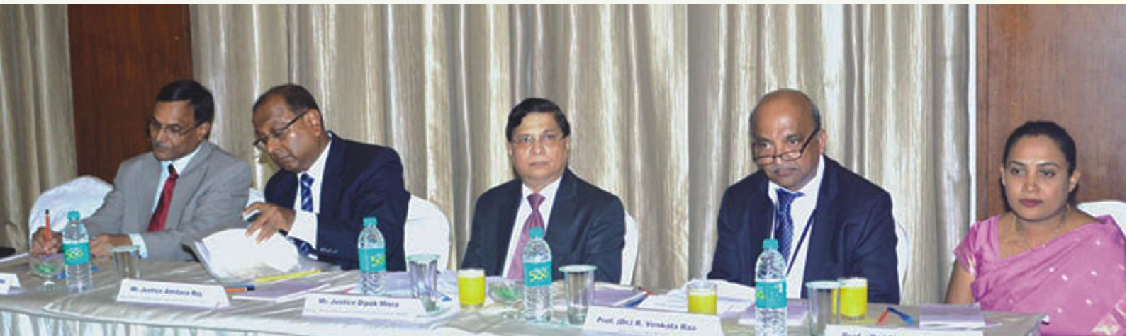
One day training programme on cyber-laws and cyber-forensics

NLUO places substantial emphasis on research activities. In order to foster a culture of research in diverse areas of law, it has since 2014 housed more than 17 functioning research centres. Eight of them are funded by the United Nations Development Project (UNDP) Access to Justice Project, while the rest are funded by the University. All centres function under the broad aegis of the University's Legal Services Clinic. Brief descriptions of some of the centres are provided below: