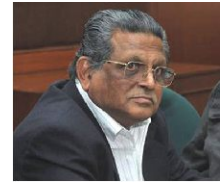
Hon'ble Mr. Justice Rajendra Babu Former Chief Justice of Supreme Court of India