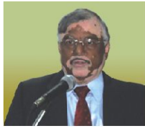
Hon'ble Mr. Justice P. Sathasivam Former Chief Justice of Supreme Court of India