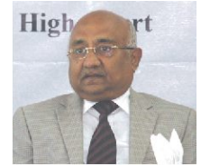
Hon'ble Mr. Justice C. Nagappan Judge, Supreme Court of India