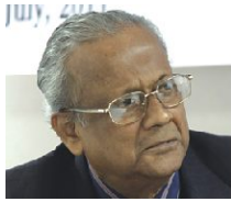
Hon'ble Mr. Justice U C Banerjee Former Judge, Supreme Court of India