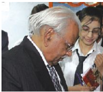
Hon'ble Mr. Justice V.S. Malimath Former Judge, Supreme Court of India