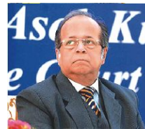
Hon'ble Mr. Justice A.K. Ganguly Former Judge, Supreme Court of India