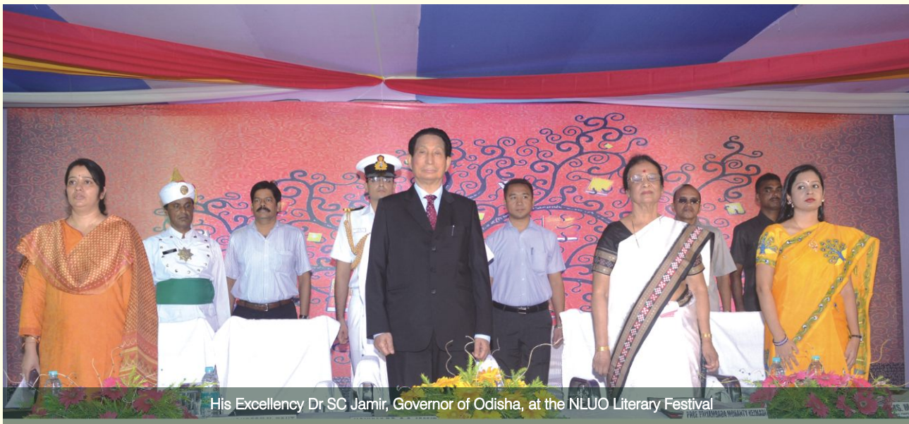
His Excellency Dr SC Jamir, Governor of Odisha, at the NLUO Literary Festival