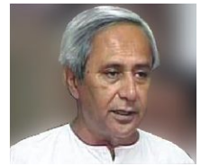
Hon'ble Mr. Naveen Pattnaik Chief Minister, Odisha