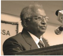
Hon'ble Mr. Justice K.G. Balakrishnan Former Chief Justice of Supreme Court of India