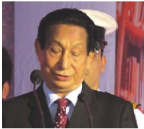
His Excellency Dr. S.C. Jamir Governor, State of Odisha