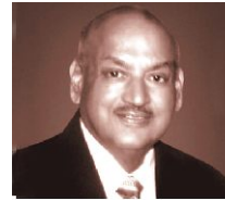
Hon'ble Mr. Justice Gopal Ballav Pattanaik Former Chief Justice of Supreme Court of India