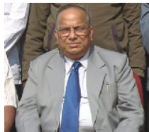
Hon'ble Justice Mr. A.K. Pattanaik former Judge Supreme Court of India