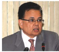
Hon'ble Mr. Justice Dalveer Bhandari Presently Judge, International Court of Justice