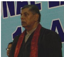
Hon'ble Dr. Justice Balbir Singh Chauhan Former Judge Supreme Court of India