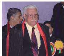
Mr. Anil Divan Senior Advocate, Supreme Court of India