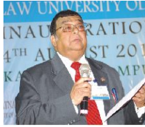
Hon'ble Mr. Justice Altamas Kabir Former Chief Justice of Supreme Court of India