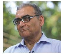
Hon'ble Mr. Justice M. Katju Former Judge, Supreme Court of India