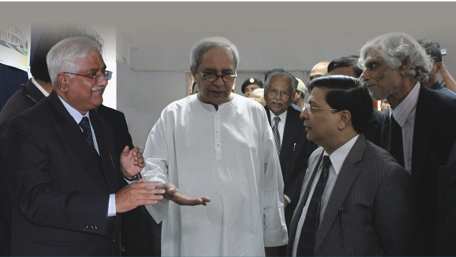
Hon'ble Mr. Justice V. Gopala Gowda, Judge, Supreme Court of India (L), Hon'ble Shri Naveen Patnaik, Chief Minister of Odisha (C) and Hon'ble Mr. Justice Dipak Misra, Judge, Supreme Court of India and our Visitor (R) at NLUO.