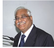
Hon'ble Mr. Justice V. Gopala Gowda Judge, Supreme Court of India