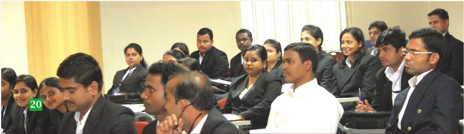
Participants at the Rajiv Gandhi Advocates Training Programme

This indicates an urgent need to establish a knowledge based organisation working solely on the legal aspects of disaster management. It is most surprising therefore that few such organisations exist, particularly in a State as disaster-prone as Odisha is. DIMALA endeavours to redress this acute need.