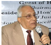
Hon'ble Mr. Justice D.P. Mohapatra Former Judge, Supreme Court of India