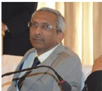
Hon'ble Mr. Justice A.K. Goel Judge, Supreme Court of India