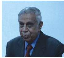
Hon'ble Mr. Justice M.N. Venkatachaliah Former Chief Justice of Supreme Court of India