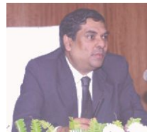
Hon'ble Mr. Justice Sanjeev Khanna Judge, High Court of Delhi