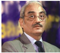
Hon'ble Mr. Justice Swatantra Kumar Chairperson, National Green Tribunal of India