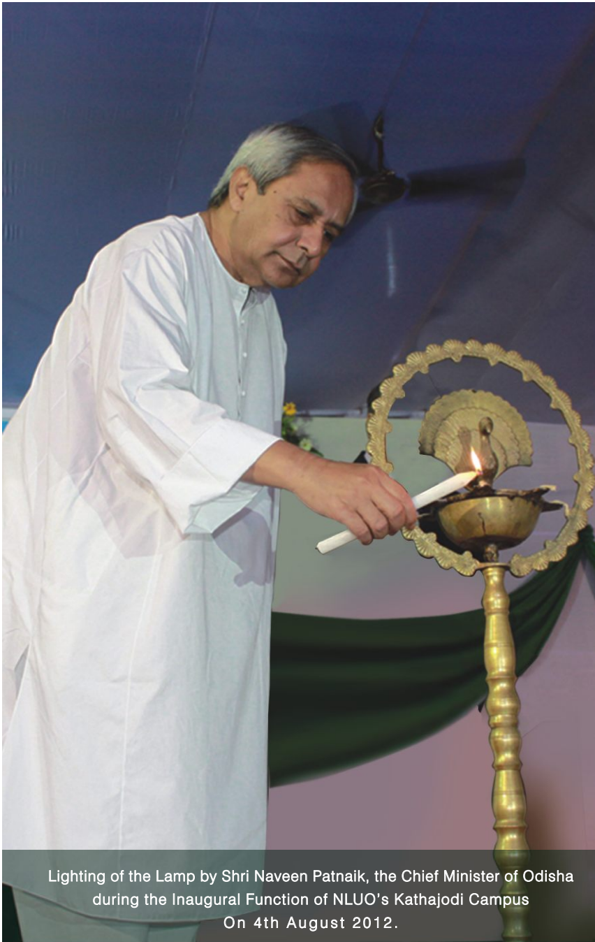
Lighting of the Lamp by Shri Naveen Patnaik, the Chief Minister of Odisha during the Inaugural Function of NLUO's Kathajodi Campus On 4th August 2012.

“Within the short span of five years since it was set up in 2009, it has made its mark as a university engaged in teaching and research in law.”