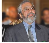
Hon'ble Mr. Justice Madan Bhimarao Lokur Judge, Supreme Court of India