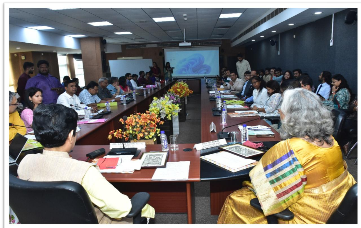
Photograph 14: Dignitaries during the 10th Anniversary programme of CCR.