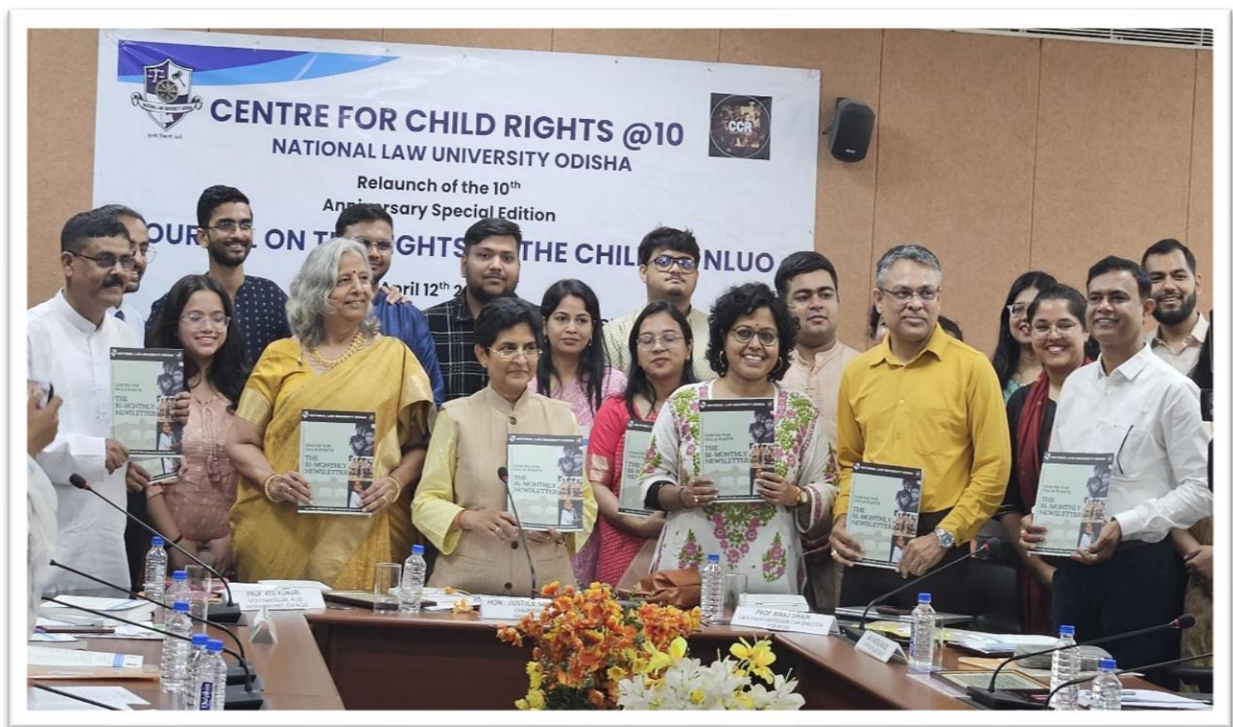
Photograph 7: The launching of the bi-monthly newsletter of April-May, 2025.