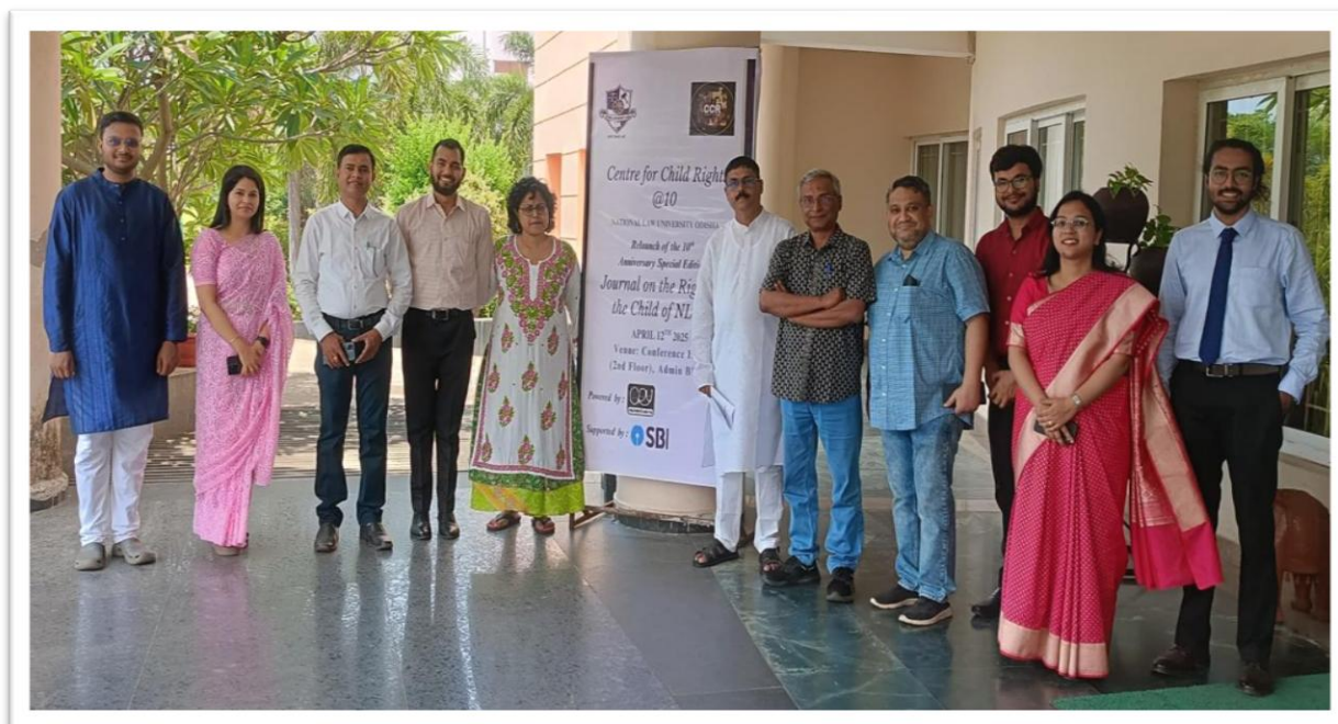
Photograph 11: Dignitaries from CRY and CCR team.