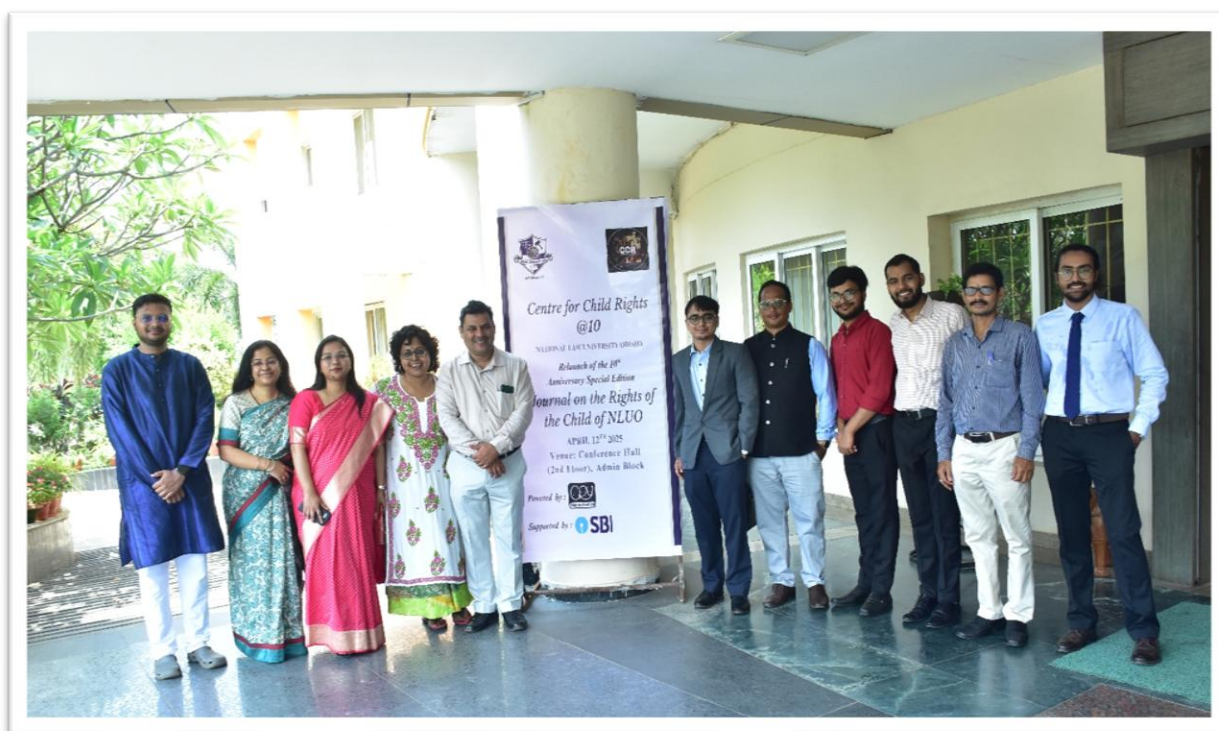
Photograph 12: Dignitaries from Action Aid India, Unicef and CCR team.