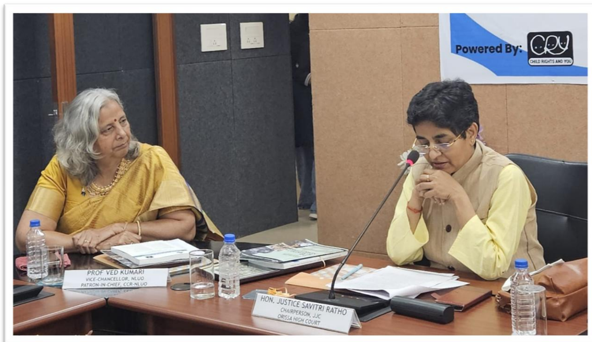
Photograph 1: Hon'ble Justice Savitri Ratho sharing her valuable insights on the issue.