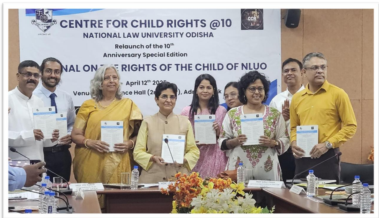
Photograph 5: Launching of the flagship journal of CCR on the remarkable 10 th Anniversary.