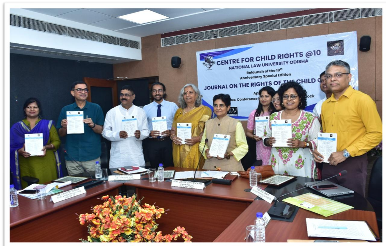
Photograph 6: Launching of the flagship journal of CCR on the remarkable 10 th Anniversary.