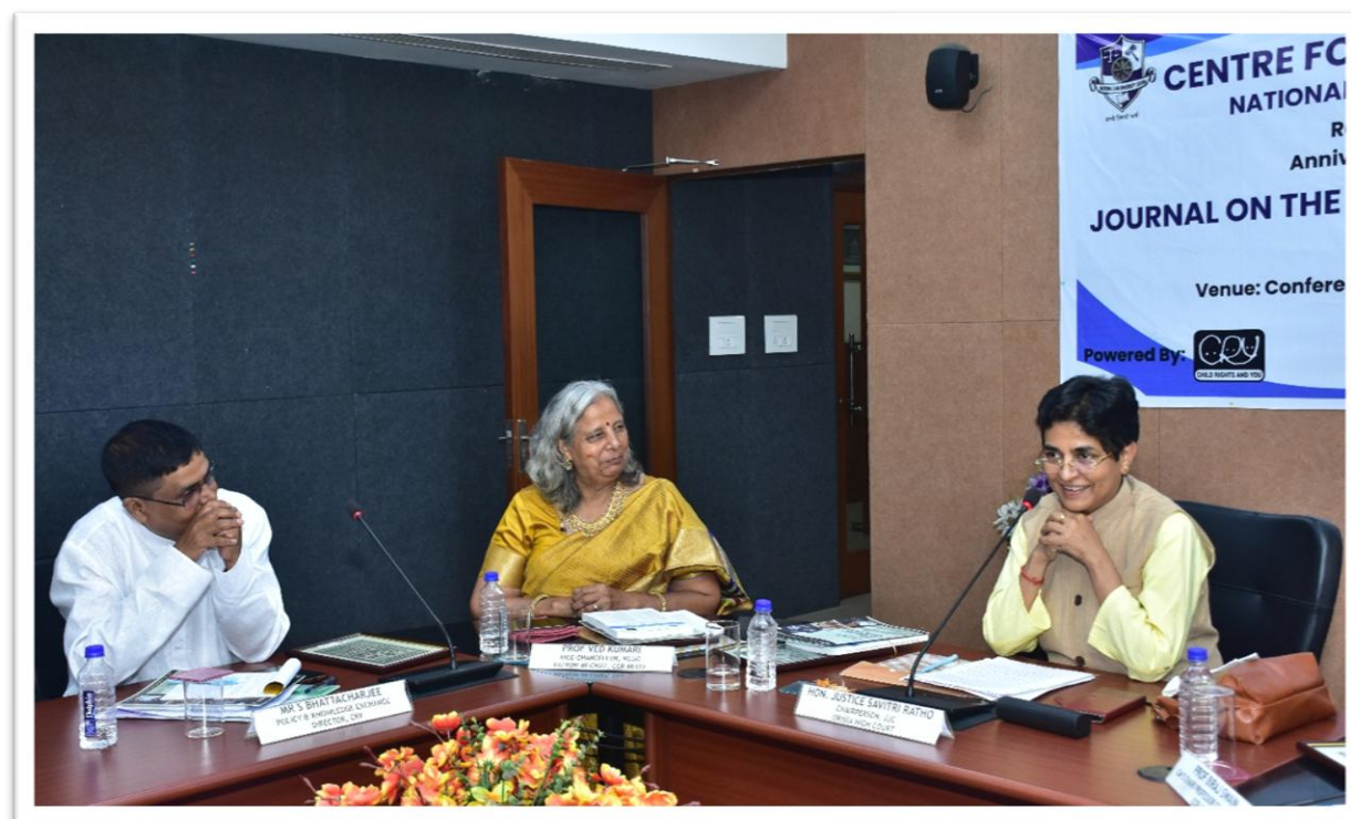
Photograph 2: Honourable Justice Savitri Ratho addressing the participants