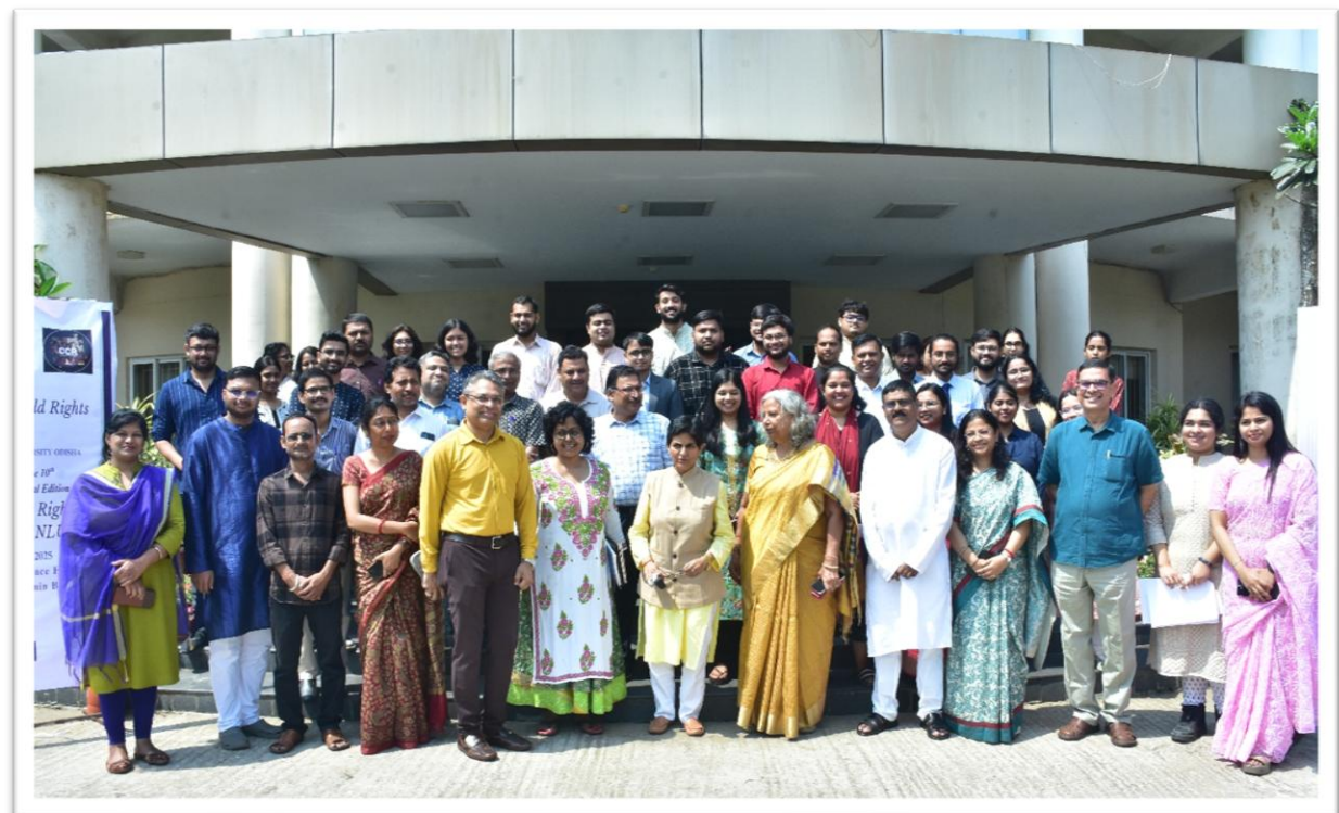
Photograph 16: Dignitaries and participants at the 10th Anniversary celebration of CCR.