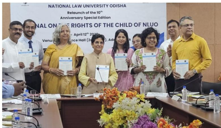
Odisha High Court Judge Justice Savitri Ratho and other dignitaries launching the flagship journal of CCR.