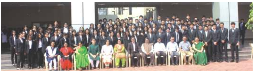
B.A.LL.B./B.B.A. LL.B Students