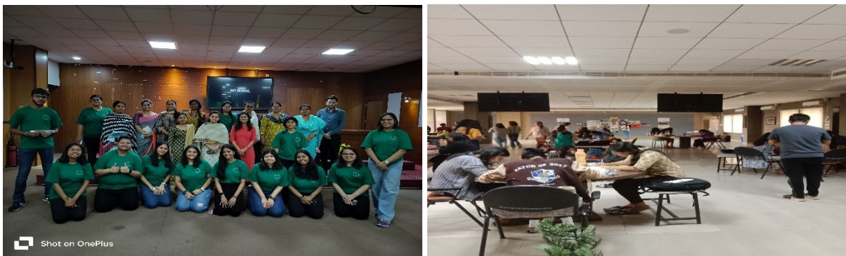
Event: PANEL DISCUSSION ON ACCESS TO JUSTICE FOR VICTIMS OF DOMESTIC VIOLENCE AND GENDER DIVERSITY IN THE LEGAL PROFESSION 20 th July 2024