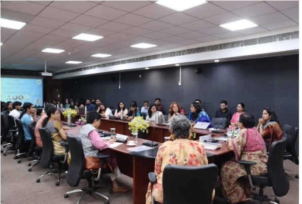
Event: A SINGLE CREDIT COURSE ON “GENDERED JUSTICE’ 29 th July 2024 - 9 th August 2024